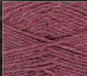
1922 Sherwood Forest