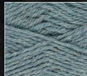
1915 Balvain Woods