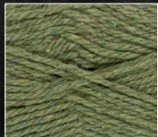
1918 Grizedale Forest