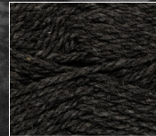
1919 Gisburn Forest