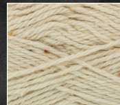
1914 Hartwood Forest