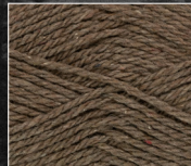
1921 Epping Forest