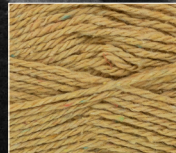
1920 Avondale Forest