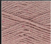
1923 Wyre Forest