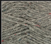
1917 Forest of Dean